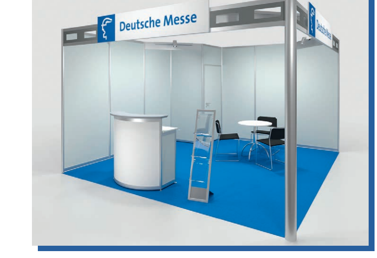
Modular stand Type A, including extended furnishings pack