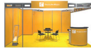
Modular stand Type A – Sunshine