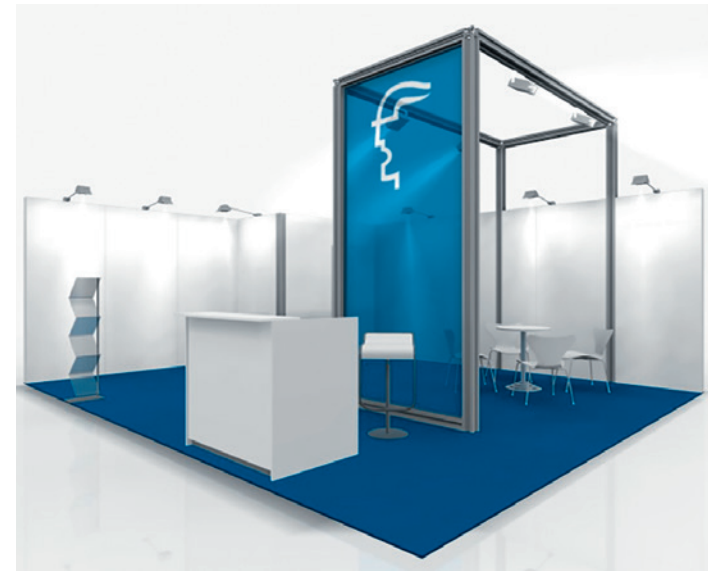
Modular Stand Type C including additional fittings/furniture