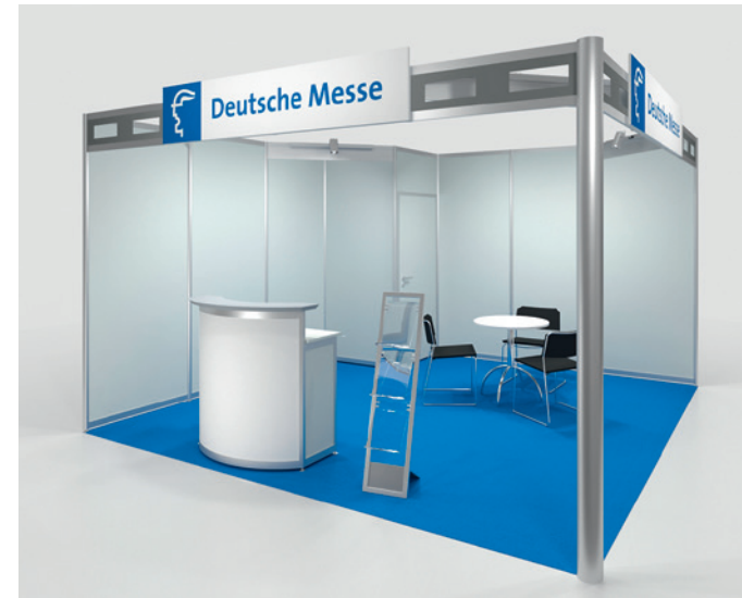
Modular Stand Type A including extended furnishings pack

** 9 m 2 Row stand with early booking. One-Year Contract