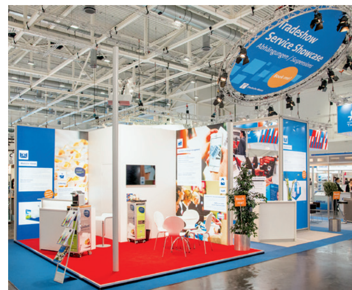
Sample design – with additional features available at extra cost