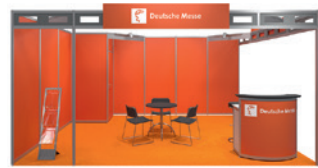
Modular stand Type A – Orange