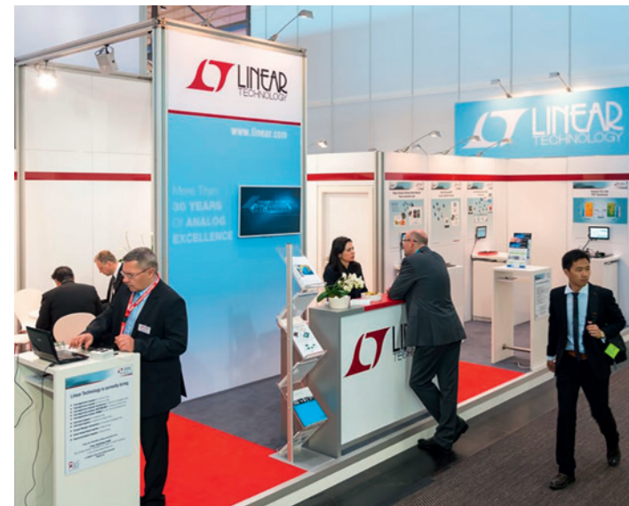
Sample design – with additional features available at extra cost