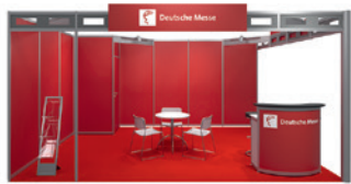
Modular stand Type A – Fire

Additional stand features can be used to create individual accents and make your stand even more attractive.