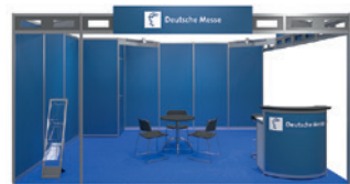
Modular stand Type A – Ocean