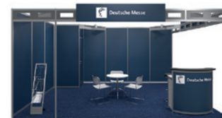
Modular stand Type A – Midnight