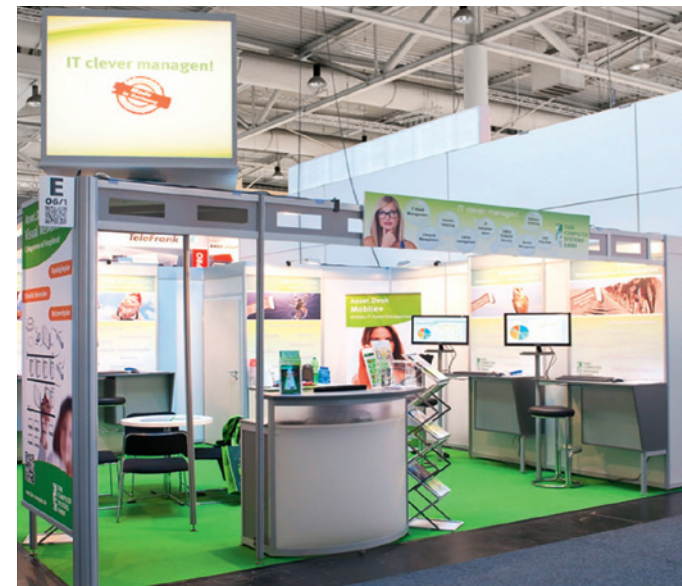
Sample design – includes additional features available at extra cost