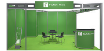
Modular stand Type A – Lime