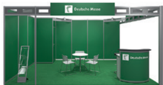
Modular stand Type A – Forest